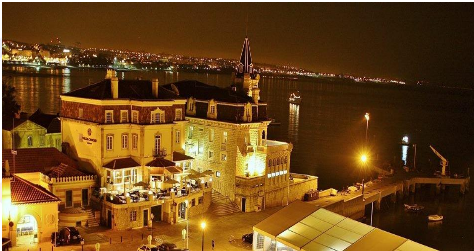
City of Cascais